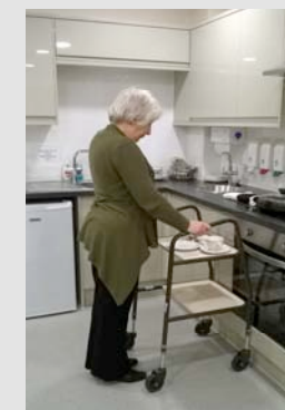
Patients using equipment funded by Catalyst