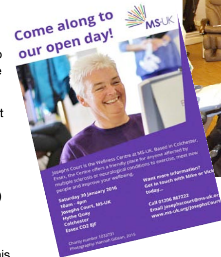
MS-UK held an open day to which Catalyst caption caption caption etc etc etc

in Colchester and were in the presence of their Patron, Her Royal Highness The Princess Royal. Livability work with disabled and disadvantaged people to help them achieve real choice, independence and opportunity and focus on what can be done rather than on what cannot. Treetops is a high dependency Centre in Colchester that provides 24 hour nursing and personal care for mainly younger residents with profound and multiple disabilities. We made this group a grant of £7,500 towards the cost of a therapeutic bath to be used by most of the residents to maximize the dignity and