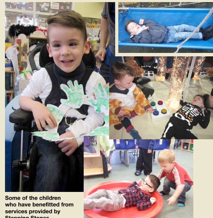
Some of the children who have benefitted from services provided by Stepping Stones

"Catalyst has been a strong supporter of Stepping Stones for many years and over that time we have been able to build positive relationships with staff and trustees. We value this very highly and are very happy with the difference Catalyst has already made and is continuing to make to the services we provide."