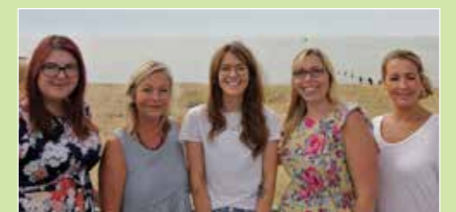
The Extra Family Support Team