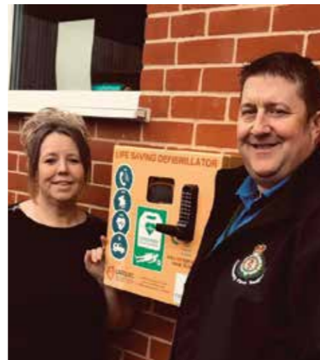
One of the defibrillators we funded for Colchester Community First Responders

Future financial performance will be affected by the investment income and growth achieved in future years.