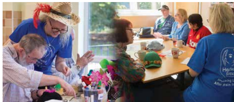
Carers providing support at Headway Essex

"In the next six months, further slipper swap events are scheduled in GP surgeries in Colchester and the Braintree area."