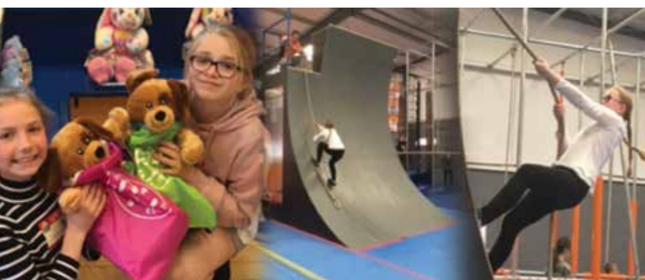
We welcomed Action For Family Carers into our Respite Scheme to support young carers

Essex university PTSD RESEARCH PROJECT £5,000