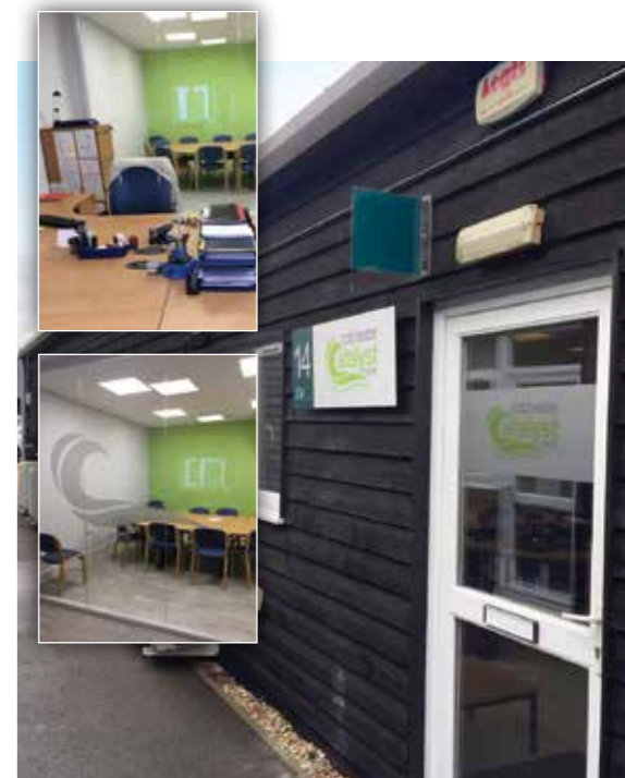
Our new premises complete with new branding

2018 also saw the move into 14, Dedham Vale Business Centre, a slightly larger premises which gives both space for our staff team to work effectively and also offers a separate meeting room. The opportunity to →