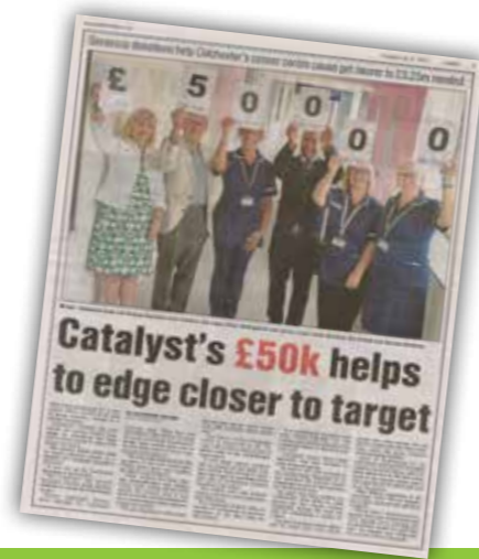
Grant boost for the new Cancer Centre at Colchester Hospital

Last year, we were also pleased to hear that a number of projects we supported in the previous year received significant funding boosts to expand the delivery of their healthcare services in the area.