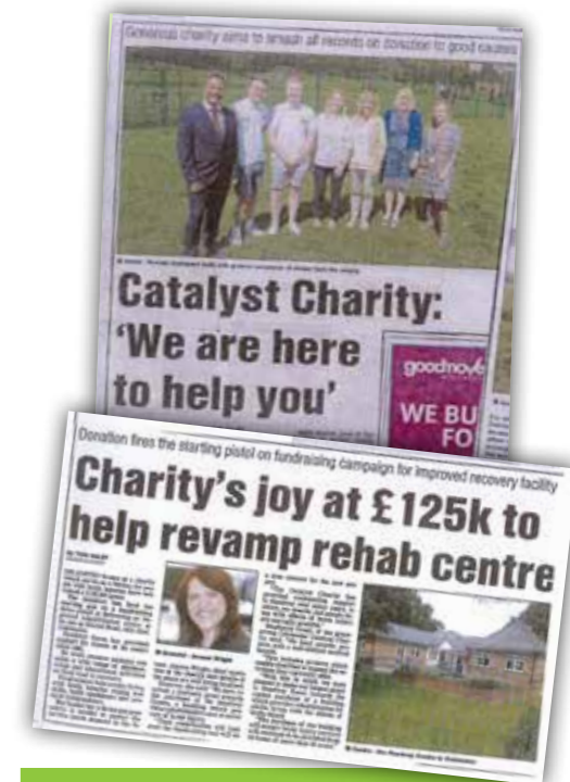
Local media coverage

These awards followed a £10,000 grant we agreed for a pop-shop in the town centre, to provide advice for older people and identify their biggest needs. The success of this pop-up shop also led to £550,000 being released from elsewhere to purchase the new property and address those needs. →