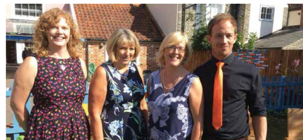
The team at the Youth Enquiry Service (we awarded YES a grant of £15,738 for counselling support)

A grant of £5,000 was awarded to Essex University to enable them to carry out research into post-traumatic stress disorder (PTSD). We were pleased to support the Clacton Leg Club with a grant of £3,000 to enable →