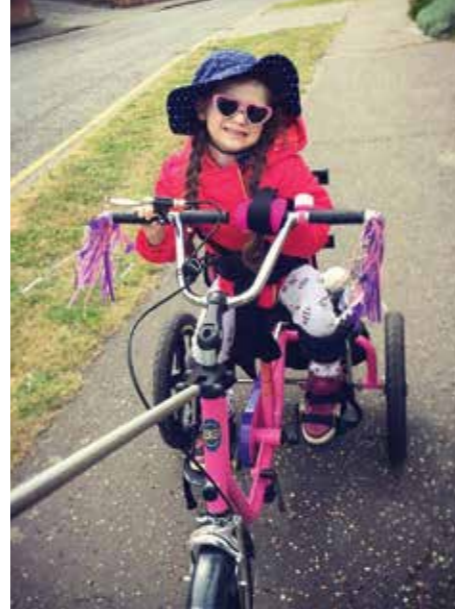
One of the physiotherapy trikes we have funded for children through SIN

When you receive this report, the Colchester Catalyst Charity will be celebrating its 30 year Anniversary. The AGM will be held in the historic Colchester Moot Hall with special guests and celebrations and I do hope that you will be able to come and mark this milestone with us. We are very grateful to all of you who work alongside us, both as part of other organisations and on our various committees, so it would be wonderful to see you there.